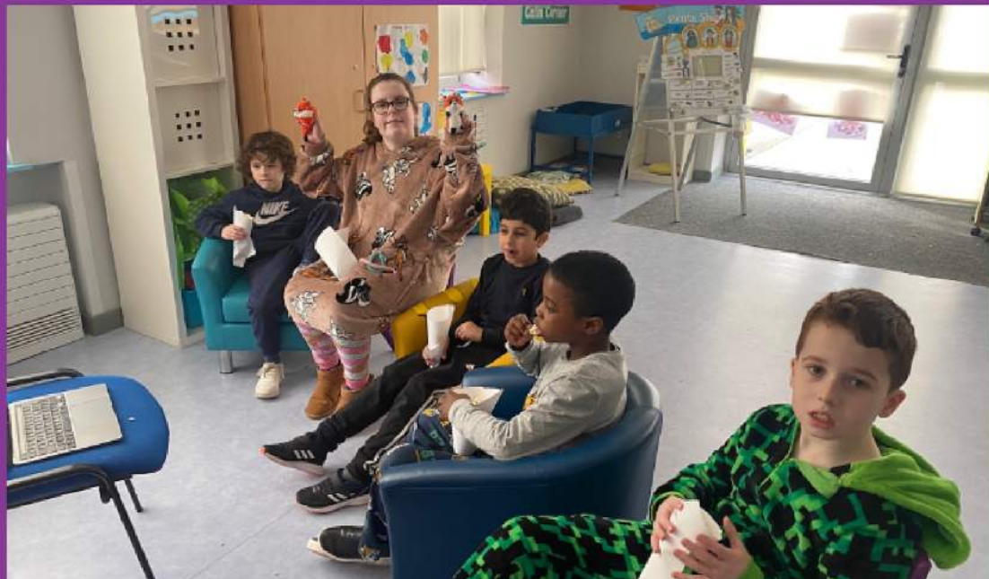
Relaxing in our pyjamas while eating popcorn and watching a movie on Amber Flag PJ Day!