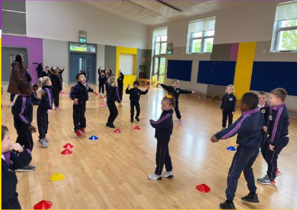
We had so much fun playing dance detective during PE.