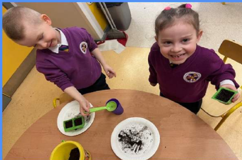
We loved learning about plants and planting our own cress seeds.