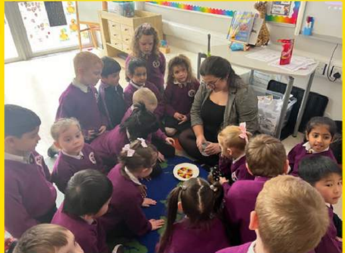
We did some amazing science experiments. Just look at that rainbow!