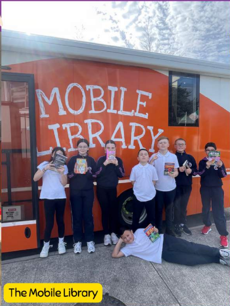
The Mobile Library