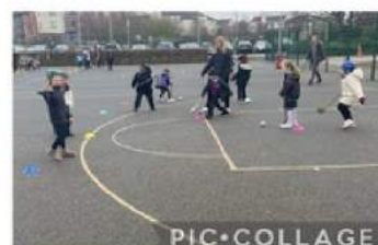
We can't forget about Pancake Tuesday! Best Day Ever!

Active week was so much fun. We got to learn and develop new skills and try our hand at some Camogie