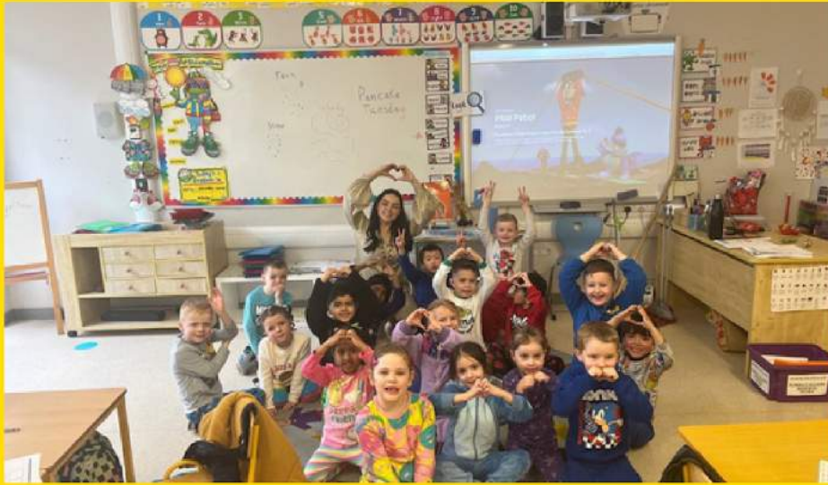
We really enjoyed our pyjama day.