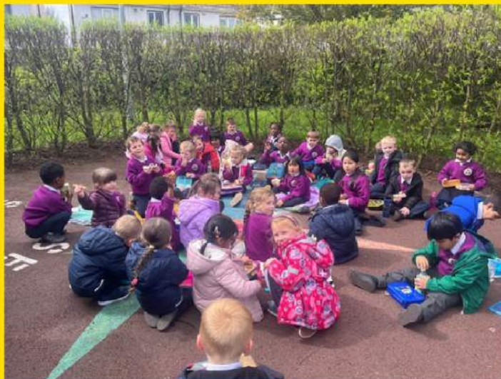
Junior Infants A and B having a picnic!