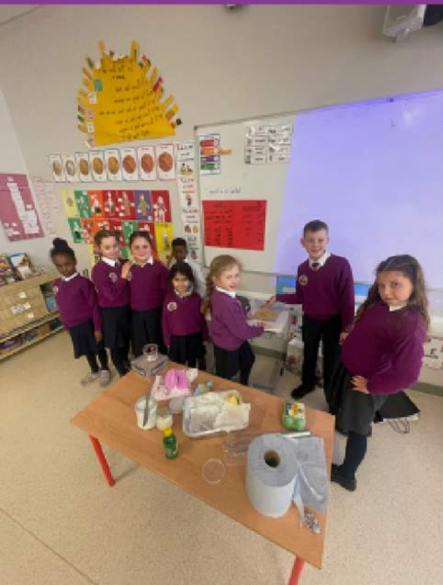
Pancake Tuesday: The children got a hands on experience making, decorating and eating pancakes using a pancake maker.