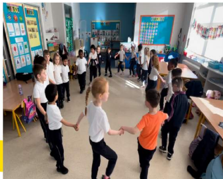
Learning Cíilí dances, Irish folklore and songs in Irish for Seachtain na Gaeilge