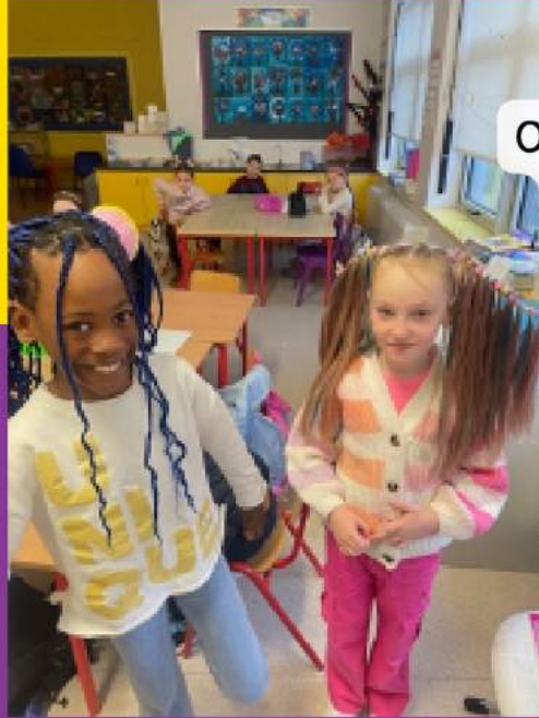
Crazy Hair Day: On this day second class showed their creativity with wild and wacky hairstyles.