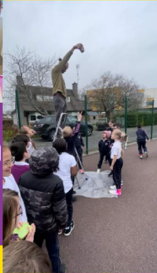
Egg Drop challenge: Through teamwork and problem solving, the children participated in the Egg Drop Challenge. They designed and constructed cases to protect their eggs using a variety of different fabrics and fibres.