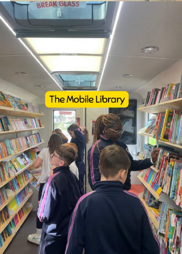
The Mobile Library