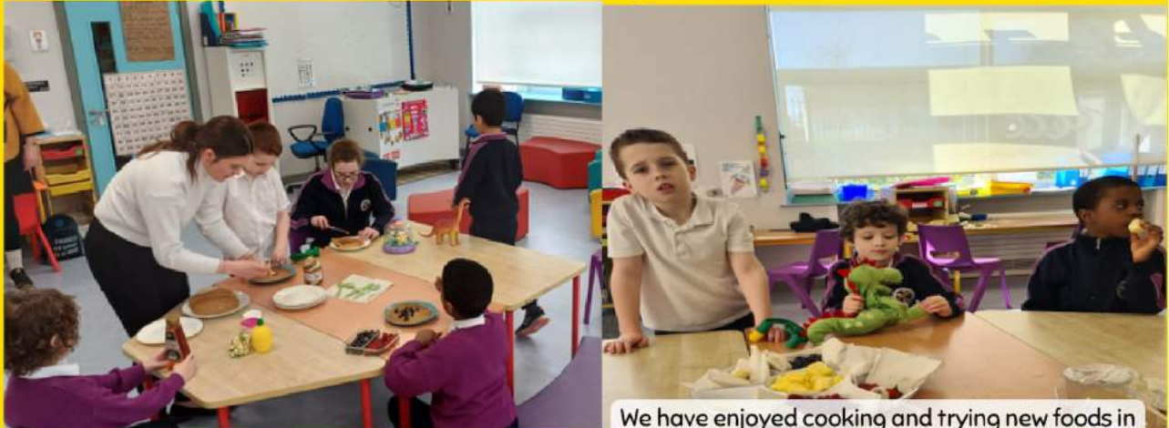
We have enjoyed cooking and trying new foods in class over Term 2. Here are pictures of us decorating pancakes and enjoying our fruit platter!

Our highlights from this term were making pancakes together and celebrating Amber Flag Day and Seachtain na Gaeilge.