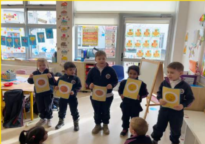
We had lots of fun in our maths lessons learning all about money.