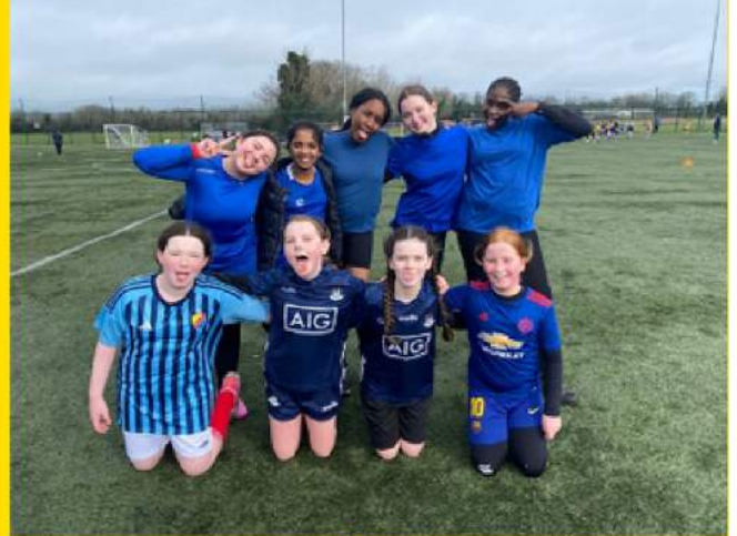
Our Boys and Girls Teams at FAI 5 Aside Blitz